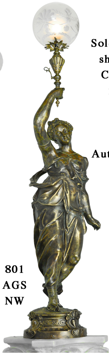
801 AGS NW