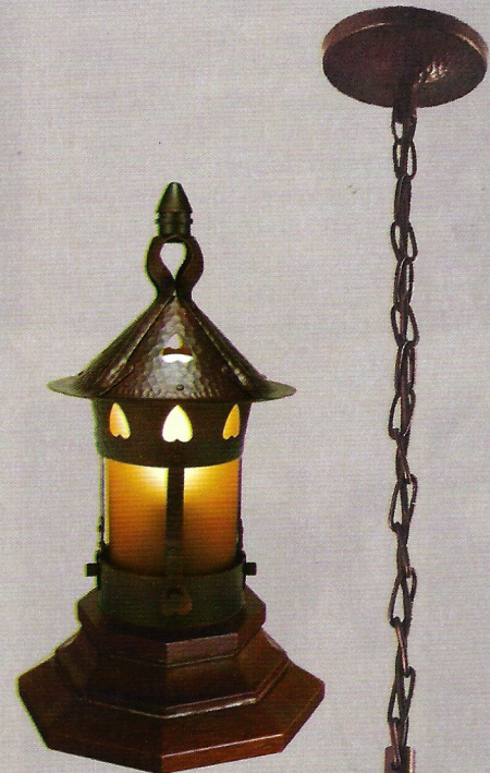
402-NEWL Shown Installed