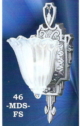
46 -MDS- FS

Our Deco Fixtures are all Solid Brass made by Lost Wax casting....NOT... aluminum or other "low quality" pot metal offered elsewhere.