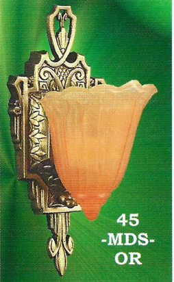
45 -MDS- OR