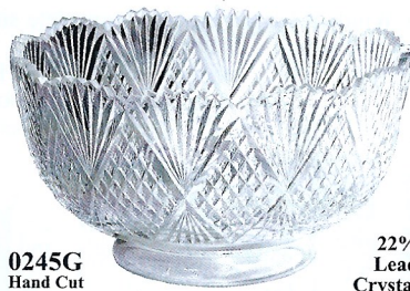
0245G Hand Cut